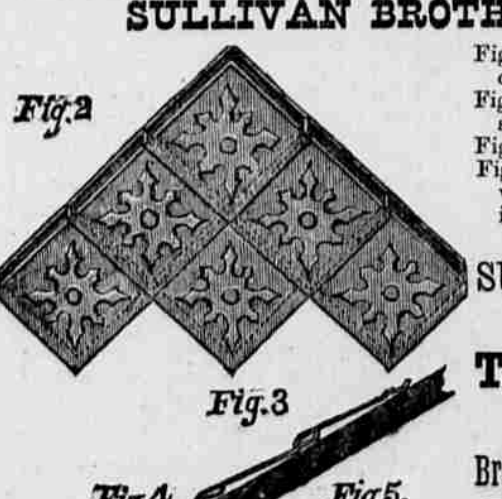
Fig. 2—View representing a number of Tiles as arranged upon a roof. Fig. 3-Detail sectional view of the

Made of Sheet Metal with Pressed Ornaments. L. Leaking, No Cracking or low-ing off. Fire Proof, Cheap and Durable. The Most Ornamental Roof Made. Practically Tested for Nearly Ten Years, With the Most Gratifying Results. SULLIVAN BROTHERS, Agents.