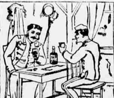
Encampments, FISHING AND HUNTING PARTIES Should have a supply of delightful HUB PUNCH.

Brown's Iron Bitters is not a drink and does not contain whiskey. It is the only preparation of Iron that causes no injurious effects. Get the genuine. Don't be imposed on with imitations.