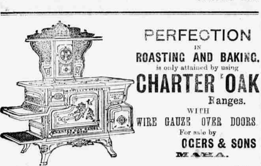
PERFECTION IN ROASTING AND BAKING. is only attained by using CHARTER OAK Ranges.

PIERCY & BRADFORD, DEALERS IN Furnaces, Fireplaces, Heaters, GRATES, RANGES, STOVES, HOUSE FURNISHING GOODS, Etc.