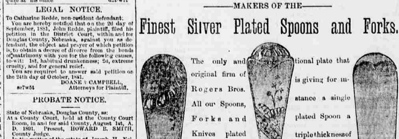
plate only on