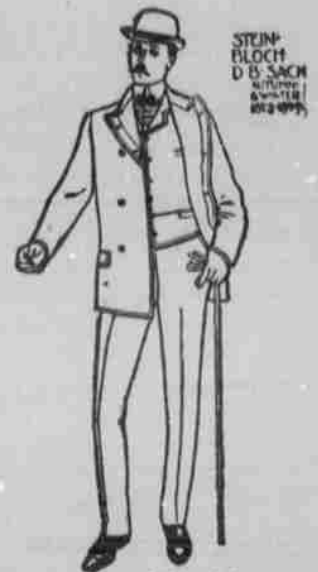
Copyright 1898 by The Stein-Bloch Co.

The money you have in your pocket is "Good Money." That which is due you is not always good. When you make a cash purchase you have to give up "good money." If you expect to get the full benefit of your hard cash you must spend it where nothing else GOES BUT CASH. That's our plan and we save our patrons a snug sum of "good money" on every purchase.