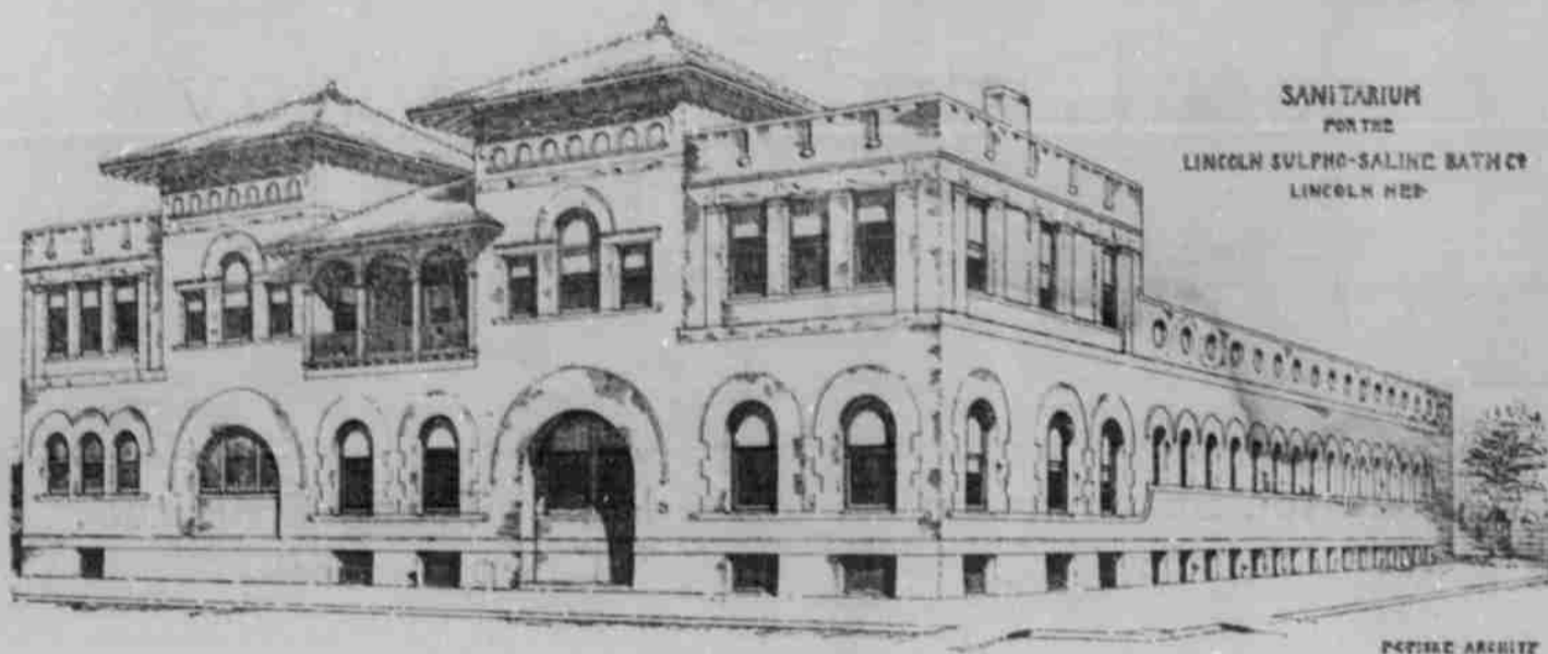
SANITARIUM FOR THE LINCOLN SULPHO-SALINE BATHS LINCOLN NEB.

Rheumatism, Skin, Blood and Nervous Diseases, Liver and Kidney Troubles, and Chronic Ailments are treated with uniform success.