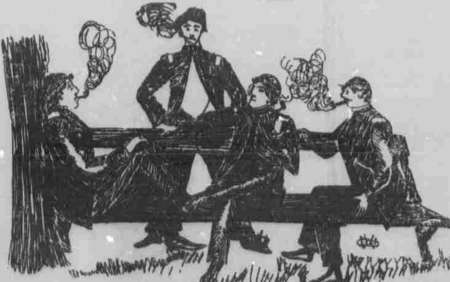
Class in military, field—Engineering.

There are four university boys who amuse themselves every morning in coming to an 8 o'clock recitation by the highly intellectual occupation of kicking a tin can for several blocks. They have evolved a new game and are thinking of applying at Washington for a copyright of the same. The four boys spread abreast over the street (preferably brick paved) and the much abused can is started. Each man is supposed to advance the can every time it comes in front of him and a point is scored against him for every failure. By the time the university is reached the one having the most points against him, sets up the crowd while all send home requests upon the paternal bank for the wherewithal to purchase new foot gear.