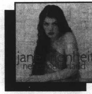
JANE MONHEIT Never Neverland $11.88 CD