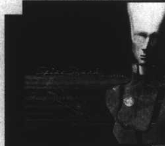
SPINE SHANK Height of Callousness $9.88 CD

Phoenix 10/21/00 Las Vegas 10/22/00 Los Angeles 10/24/00 San Diego 10/25/00 Fresno 10/27/00 San Bernardino 10/28/00 Sacramento 10/30/00 San Francisco 10/31/00 Portland 11/2/00 Boise 11/3/00 Seattle 11/5/00 Seattle 11/6/00