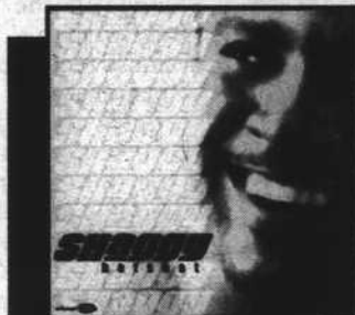
SHAGGY Hot Shot $13.88 CD

Phoenix, Arizona's rap-rock pioneers serve up a new CD full of in-your-face hard hittin' phunked up RAP'n-ROLL. SEX, DRUGS AND RAP'N ROLL, the fourth album from the Phunk Junkies, will feature guest appearances by Sen-dog, Pokaface and Common Sense.