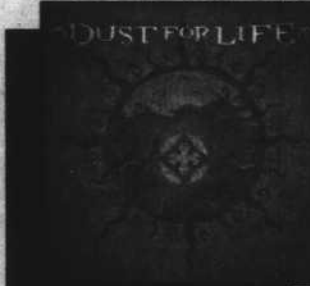
DUST FOR LIFE Dust For Life $12.88 CD

17 classic Southern rock hits, as Seen On TV. Featuring George Thorogood, The Destroyers, The Band, Charlie Daniels Band, Molly Hatchet, .38 Special, Allman Brothers, Lynyrd Skynyrd, Pure Prairie League, Marshall Tucker Band, Georgia Satellites, Little Feat, Fabulous Thunderbirds, Mountain, Ram Jam, B.W. Stevenson, The Doobie Brothers and Joe Walsh.