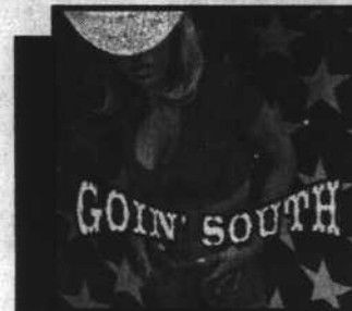
VARIOUS ARTISTS Goin' South $13.88 CD

Some people just love a challenge. Grammy-winning reggae/pop superstar Shaggy is one of those people. His favorite challenge, however, is one he poses to himself every time he enters the studio and draws on his limitless hit-making talent. Hot Shot proves Shaggy remains a master from reggae and dancehall to pop/R&B.