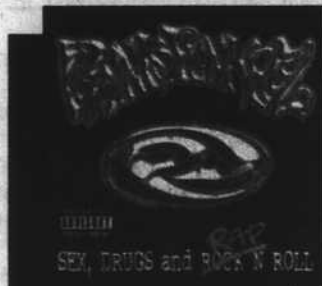
PHUNK JUNKIES Sex, Drugs & Rap 'n' Roll $12.88 CD

David Coverdale, the legendary voice of Whitesnake, Coverdale Page & Deep Purple, has just completed his much awaited solo album, INTO THE LIGHT. David has sold more than 50 million albums over the span of his unparalleled career. He is regarded by many as one of the greatest vocalists in the history of rock 'n' roll, and has performed for millions of fans around the world.