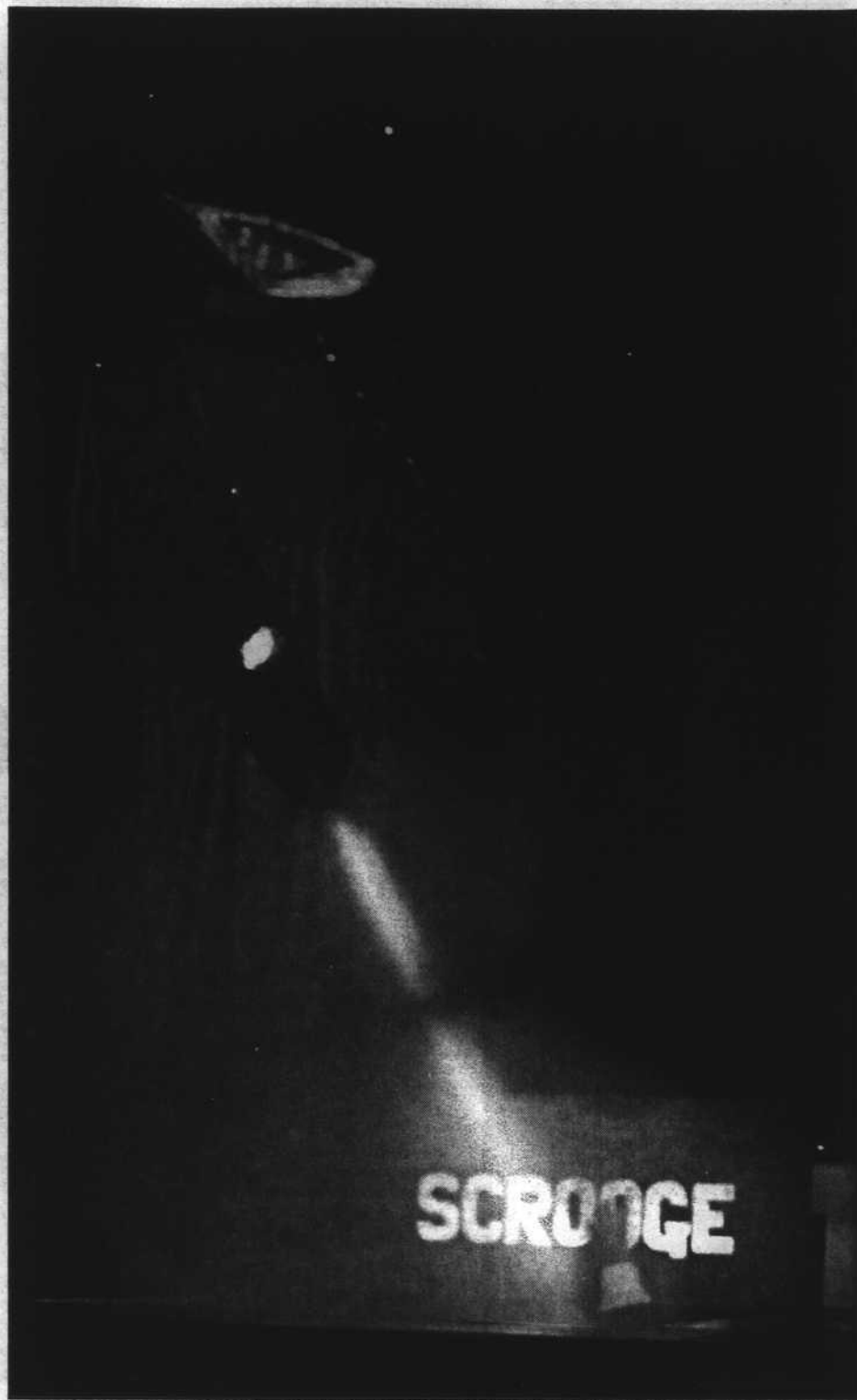
LEFT: Ebenezer Scrooge makes a dreamy decent into his own grave, an act that frightens Scrooge and helps instill in him a new perspective on life.