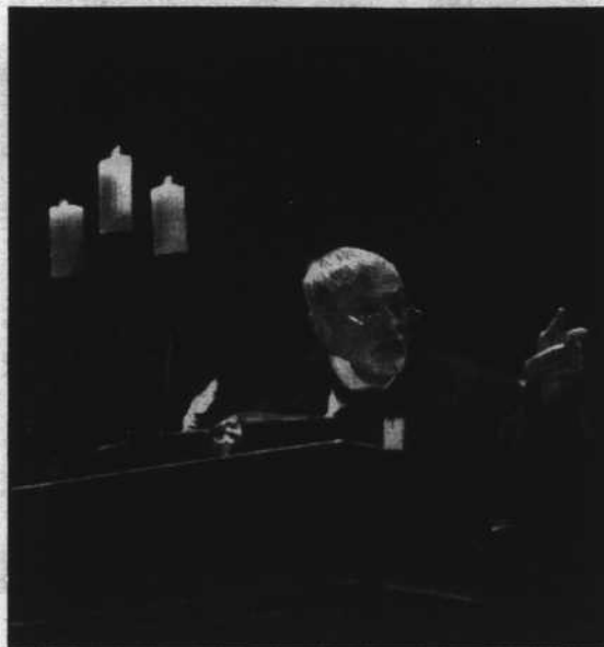
ABOVE: Scrooge spends a late night reviewing his business books before the spirits visit him. The spirits reveal to him his uncaring character.