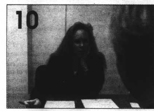
SHOP TALK: Career services offers advice. interviews for job seekers

Graduate school means hard work, decision making and a host of opportunities