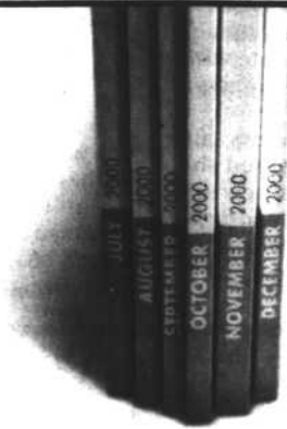
Do research in the library.

State Sen. Ernie Chambers of Omaha also is expected to speak at that rally.