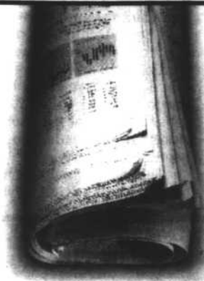
Do research in the newspaper.