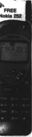
FREE Nokia 252

Get An Additional 500 MINUTES On Select Rate Plans!