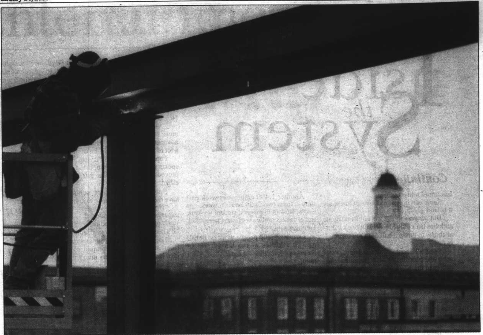
RIGHT: A WELDER finishes working on joints between two of the large steel beams that are forming the structure of the Kauffmann Residential Center, north of the Nebraska Union. The center will house students who belong to the J.D. Edwards Honors Program for computer science and management majors.