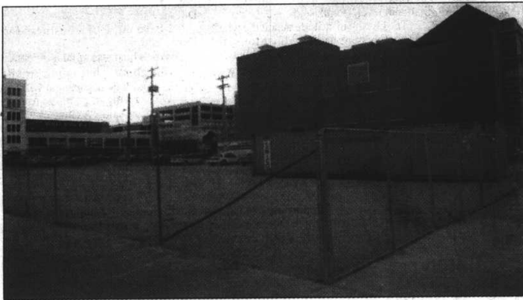
BELOW: A FENCE now marks the area where the old International Affairs and Summer Sessions offices stood next to the Temple Building at 13th and R streets.