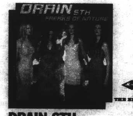
DRAIN STH Freaks of Nature $12.88 CD

In 1999, Jimmie's Chicken Shack returned to the studio to record their follow-up LP. The album features an array of new sounds, which reveals the growth that has taken place in their songwriting and playing. New gems such as "Do Right," "Trash," and Oow" show the band at their most playful and melodic, coyfully schmoozing their contemporaries.