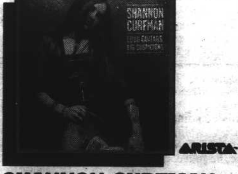
SHANNON CURFMAN Loud Guitars Big Suspicions

With music both powerfully raw and profoundly confessional. Drain STH represents the hard rock and heavy metal scenes that are amnipresent in their native country of Sweden, offering music fraught with fierce energy as well as melodic hooks. The bands new release sees them taking their forcefully passionate sound to the next level.