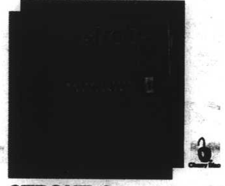
STROKE 9 Nasty Little Thoughts $9.88 CD

With a blend of progressive pop melodies with a modern rock edge, Mollys Yes has found the right formula for success. Building on the solid foundation that has already been established in their home region of Tulsa, Oklahama, Mollys Yes will be the next big thing to hit radio.