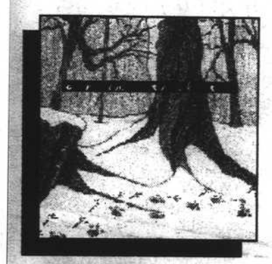
VARIOUS Christmas Tracks Too

IF I LEFT THE ZOO, is a rare blend of innovation, artistry and simple, good natured fun. The band's distinctive style shines through on a project that genuinely captures the total personality of Jars of Clay like never before.