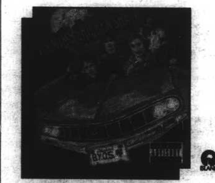
JIMMIE'S CHICKEN SHACK Bring Your Own Stereo $12.88 CD

Sale prices effective November 19 to December 16, 1999