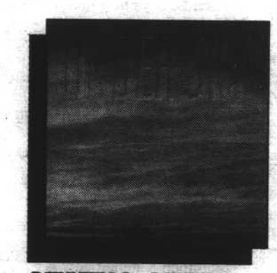
STATUS STATE Under Sky

Including tracks from Mulberry Lane, Compost, Five Story Fall, Echo Farm and more. A portion of the proceeds from CHRISTMAS TRACKS TOO will go to the Nebraska Hurnane Society.