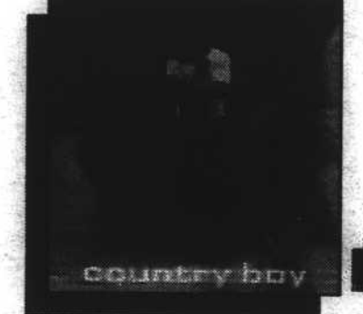
CALVIN RICHARDSON Country Boy $9.88 CD

Described by Kerrang Magazine as a "thrilling mix" of Middle Eastern folk and Sepultura-style bludgeon," System Of A Down's members are of Armenian descent, raised in Southern California. Since formation, the band has built a hard-core following that originated in Los Angeles due to their incredible live shows.