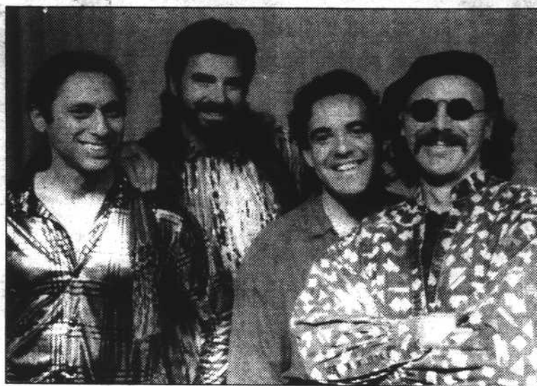
The Edlos, who call themselves the Bad Boys of A Cappella, will perform at the Lied Center on Friday.

For more information about the performance, visit the Lied's Web page at www.unl.edu/lie .