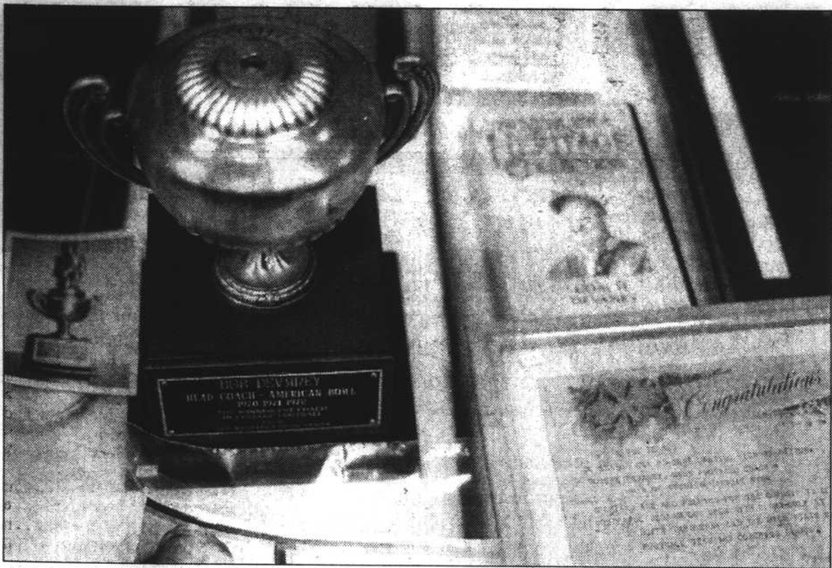
MEMORABILIA LINE tables at an auction of the late former athletic director and football coach Bob Devaney's possessions Friday night in the Nebraska East Union.