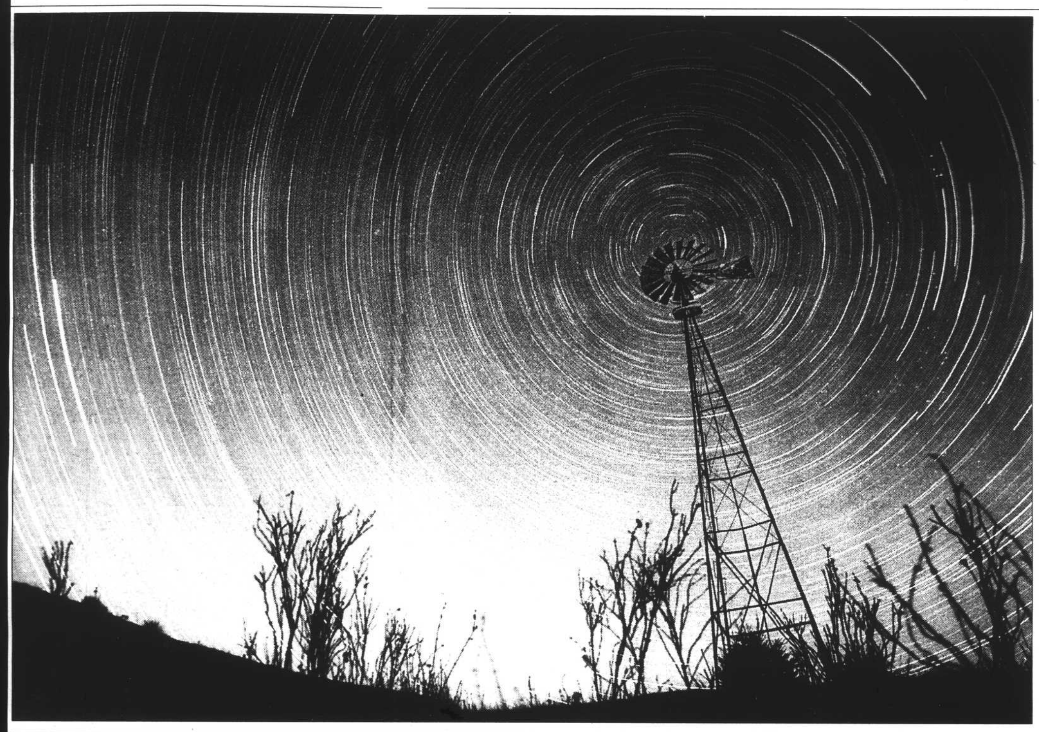
LEFT: I SPENT ABOUT TWO YEARS thinking of this photo, about an hour setting it up, three hours exposing the negative and countless hours explaining my vision of the outcome to my grandparents. The final product looked just as I hoped.