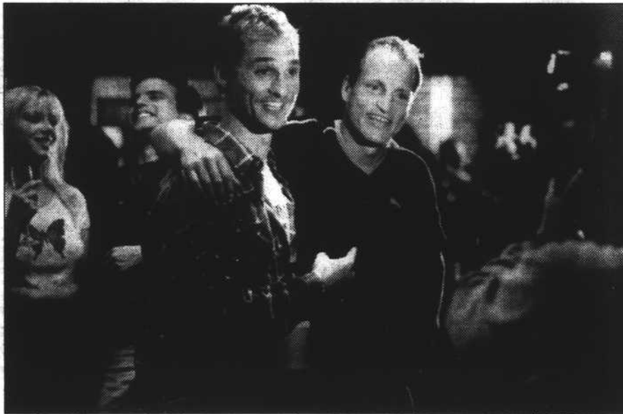
MATTHEW MCCONAUGHEY and Woody Harrelson play the Perkurny brothers - Ed and Ray - in the new Ron Howard comedy centered on media invasion.

Inevitably, there will be comparisons between "EDtv," the new Ron Howard movie, and "The Truman Show," the brilliant, Academy-snubbed film with Jim Carrey.