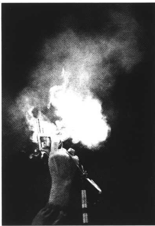
ABOVE: THE GUN SOUNDED loudly and often over two days during the Frank Sevigne Husker Invitational.