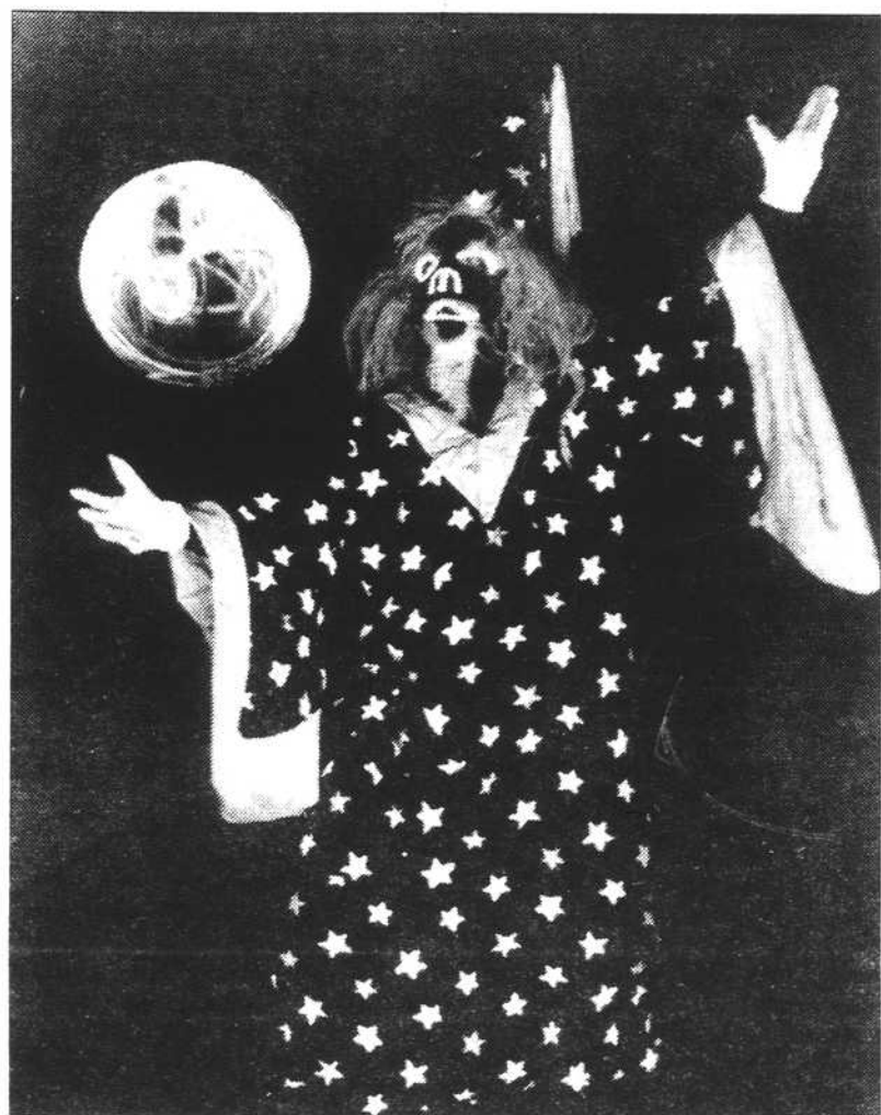
THE JUGGLING CLOWN is a favorite entertainer of the Lazer Vaudeville troupe. The show combines age-old circus tricks with new-age light effects.

arrives." The troupe is holding a free juggling workshop at the Lied on Friday at noon open to the public.