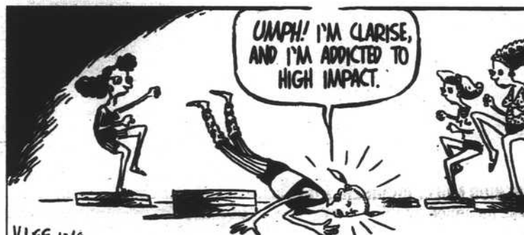
VLIEE 12/9 www.fingertures.com