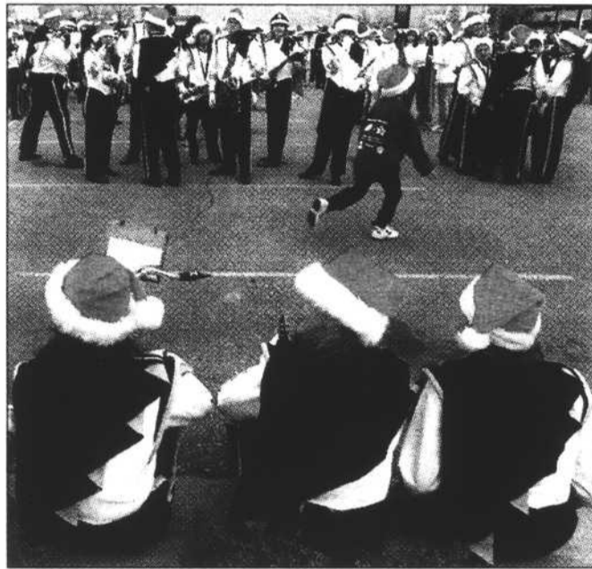
LEFT: THE SEWARD HIGH SCHOOL BAND added holiday cheer to their ensemble by uniformly sporting red Santa hats for the parade.