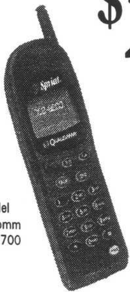
Model Qualcomm QCP 2700

$24 99 / 70 Minutes Anytime Plus 500 Night And Weekend Minutes