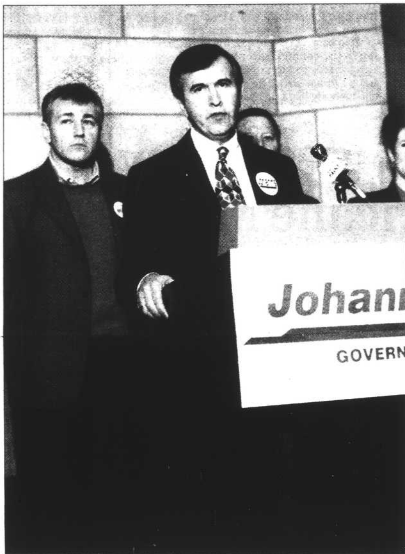
REPUBLICAN GUBERNATORIAL CANDIDATE Mike Johanns speaks to a crowd of about 25 reporters and supporters in the Nebraska State Capitol on Monday afternoon. Johanns encouraged supporters to get voters to the polls today.