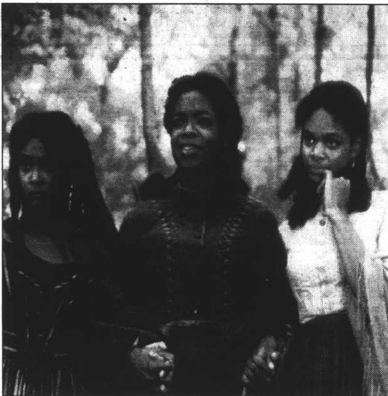
OPRAH WINFREY (center) stars as Sethe, Thandie Newton (left) stars as Beloved, and Kimberly Elise (right) stars as Denver in "Beloved," based on the Pulitzer Prize-winning novel by Toni Morrison.

Glover also does a fine job in his portrayal as the kind-hearted yet dimwitted Paul D. Though not a huge