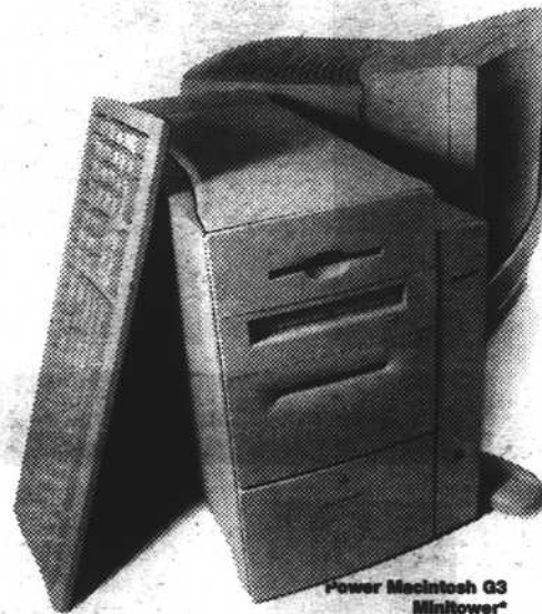
Power Macintosh G3 Minitower*

When you purchase a Power Macintosh G3 desktop or minitower computer from July 11th through October 24th, 1998 , you can also choose one of these three powerful add-ons at no additional cost.