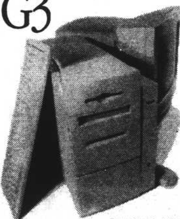
Power Macintosh G3 Minitower

We'll be there when you need us. This option increases your service coverage to a total of three years—two years longer than your standard service agreement.