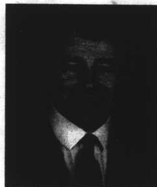
Senator Chuck Hagel