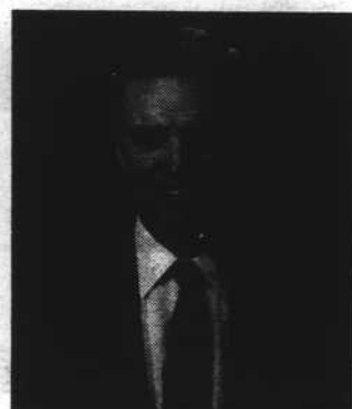
Senator Bob Kerrey