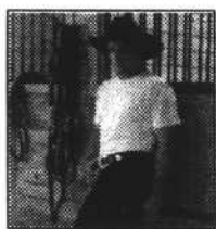
Garth Brooks "Sevens" Capitol Grade: A

When a song's ambiguity leaves the listener wondering if the singer's talking about his truck or his woman, you've got pure country.