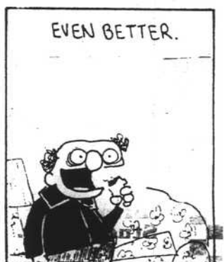
BY CHAD STRAWDERMAN