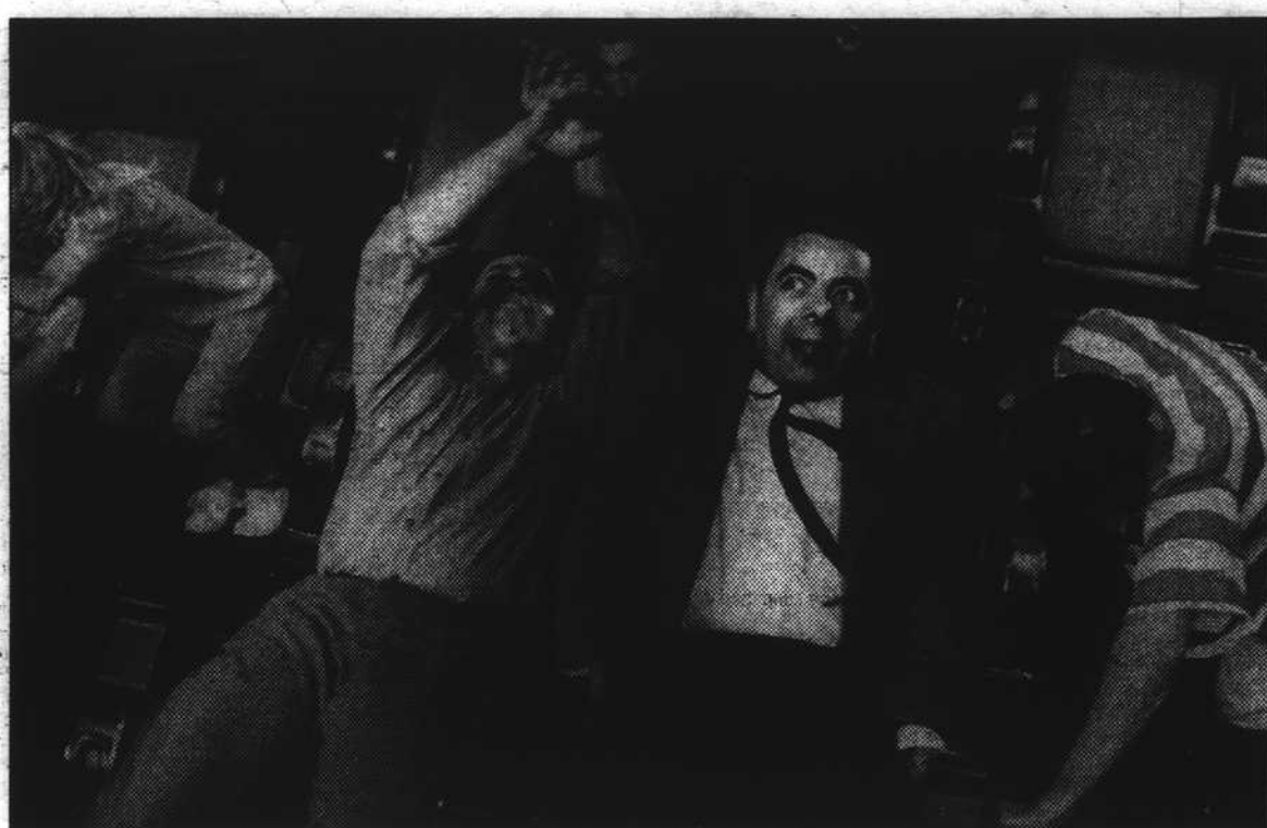
DAVID AND BEAN (from left, Peter MacNicol and Rowan Atkinson) react to their over-amped interactive theater seats in "Bean."