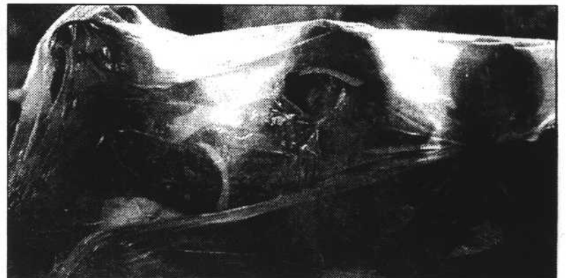
HUSKER FANS at Kansas' Memorial Stadium covered themselves with plastic to keep dry during the Nebraska shutout over the Jayhawks. Attendance at Saturday night's game was estimated at 42,000, while more than half were NU fans.

With the agreement of both coaches, the game continued, but NU's offensive momentum remained off. Nebraska did not earn a first down for five series following the