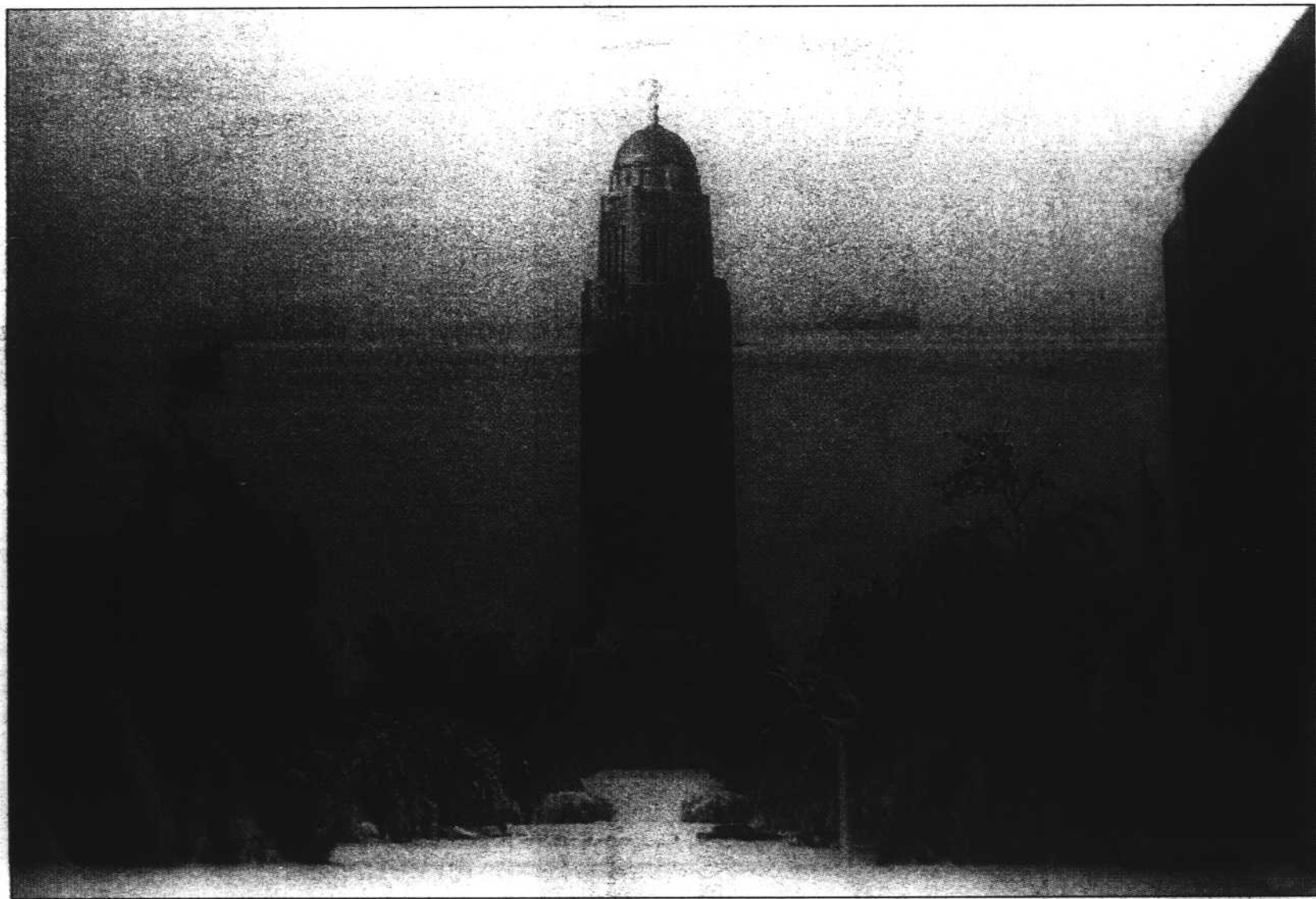
NEBRASKA'S STATE CAPITOL building stands strong over Lincoln. The city was devastated by heavy, wet snow that ripped trees limb from limb, tore power lines from their poles and imprisoned people in their homes. About 25,000 people were without power Sunday.