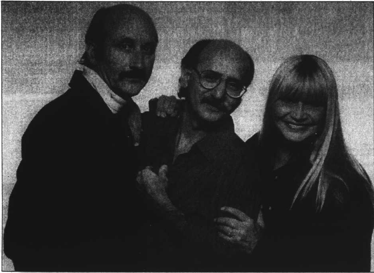
THE PERFORMANCE OF Peter, Paul and Mary Friday at the Lied Center included a tribute to John Denver, who wrote the song "Leaving on a Jet Plane."