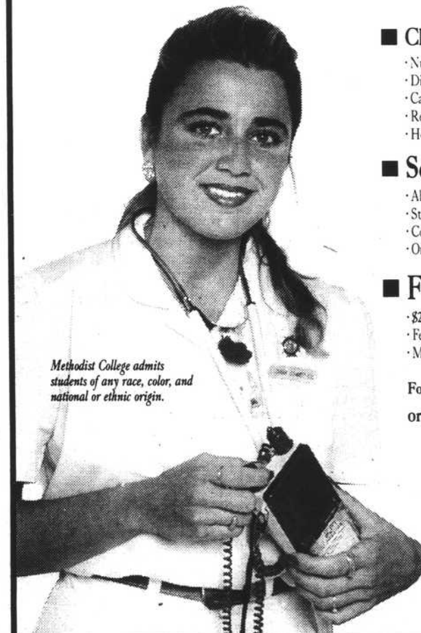
Methodist College admits students of any race, color, and national or ethnic origin.

Methodist College invites you to join those who give not only to their profession, but also to the future.