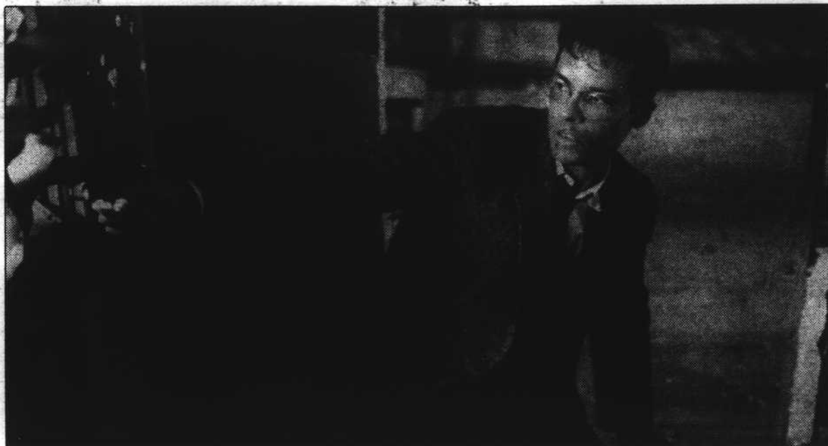
DETECTIVE ED EXLEY (Guy Pearce) encounters danger in 1952 Los Angeles while solving a restaurant murder in "L.A. Confidential."

Fishbone is currently touring and has branched off to join 311 for the Midwest leg of its tour. The group should play a collaboration of songs from all albums, while concentrating on those from "Chim Chim's."