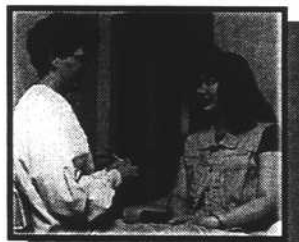
Time for a dental checkup?