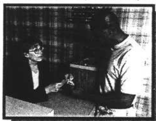
Need a prescription filled?