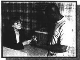
Need a prescription filled?