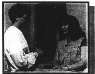
Time for a dental checkup?