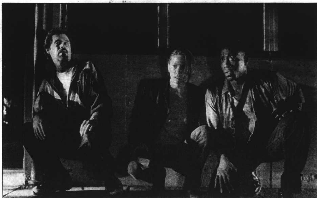
"MURDER AT 1600" stars (from left to right) Dennis Miller, Diane Lane and Wesley Snipes.

Film: "Murder at 1600" Stars: Wesley Snipes, Diane Lane, Alan Alda, Dennis Miller Director: Dwight Little Rating: R (Nudity, Language, Violence) Grade: B+ Five Words: White House cover-up? No way!