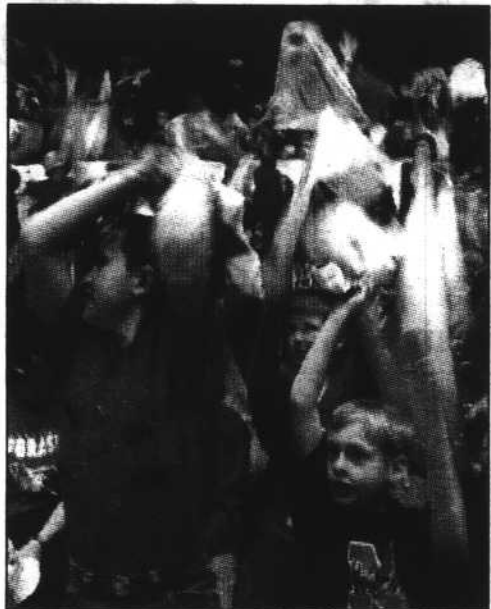
SOME OF THE 11,000 CHILDREN in attendance cheer during the jam.