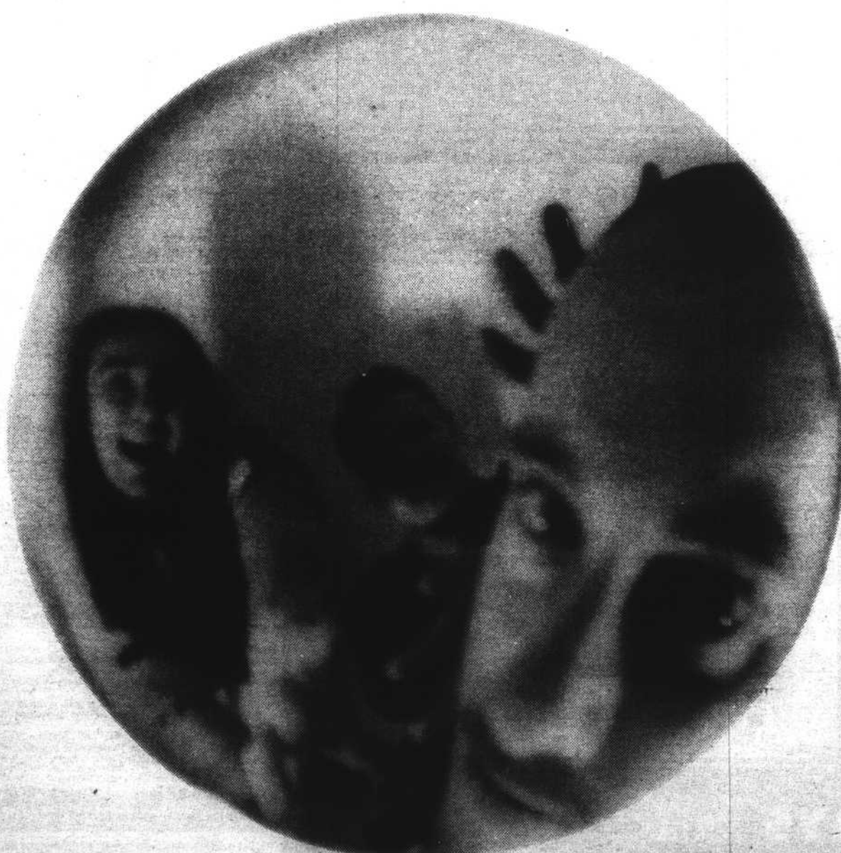
SECRET SKIN , an Omaha-based band, will perform at Hangar 18 Saturday night.

Or, if you just want to hang around, Thrilling Head Gear and Thread will play at Knickerbockers on March 29, saving you gas money.