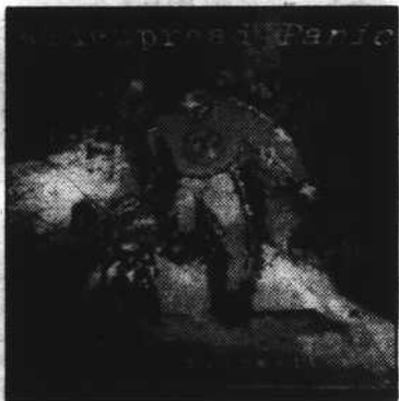
Widespread Panic "Bombs & Butterflies" Capricorn Records Grade: B-

precedented "alternative" level they are getting into the very roots of modern music.