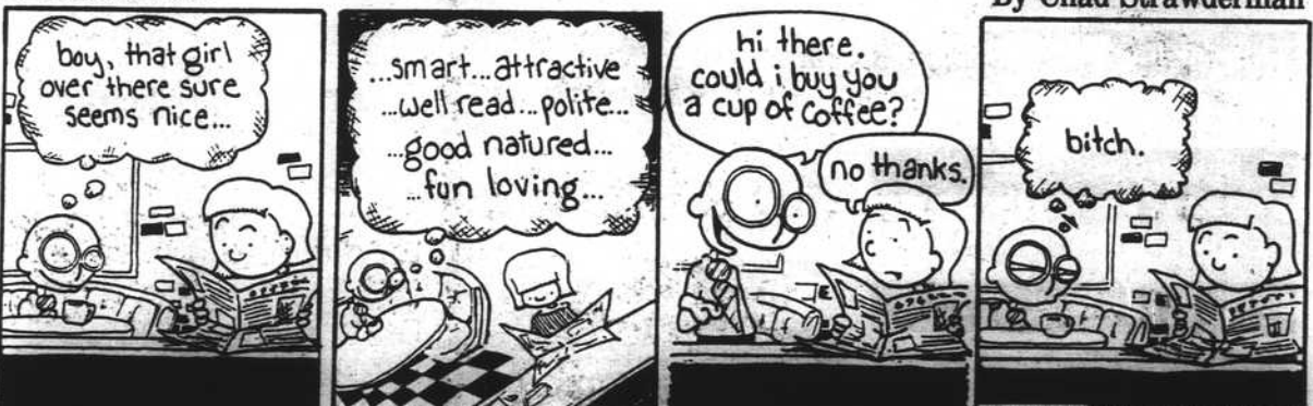
By Chad Strawdman