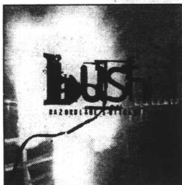
Bush "Razorblade Suitcase" Interscope Records Grade: B-

After being on the road for two years, Bush returned with a little extra luggage. And you won't believe what's inside.