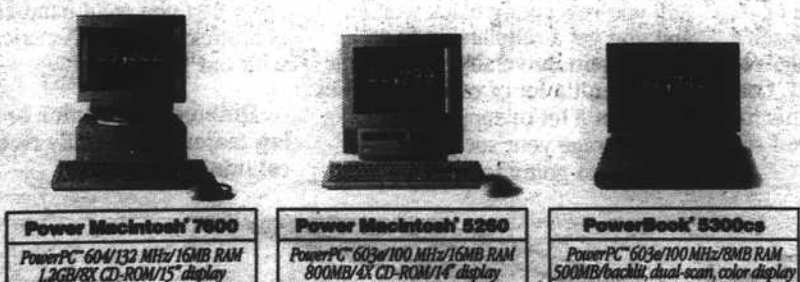
Power Macintosh 7600 PowerPC 604/132 MHz/16MB RAM 1.2GB/8X CD-ROM/15" display