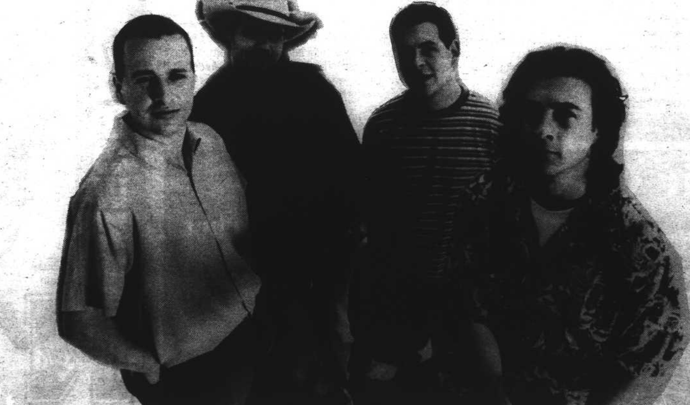
Poe, top, and The Refreshments, above, will perform at Edgefest.