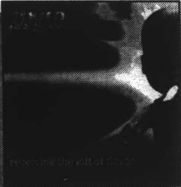
THE URGE Receiving the Gift of Flavor