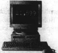
Macintosh Performa 6290 603e/100 MHz/8MB RAM/1.2GB 4X CD-ROM/28.8 modem/14" display