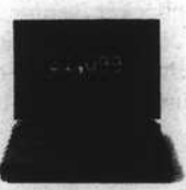
PowerBook 190cs 66 MHz/8MB RAM/500MB backlit, dual-scan, color display

Visit your campus computer store for the best deals on a Mac.