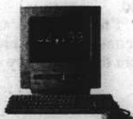
Power Macintosh 5400 PowerPC 603e/120 MHz/16MB RAM 1.6GB/8X CD-ROM/15" display