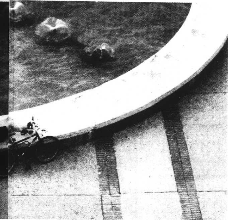
LEFT: Broyhill Fountain, a popular gathering place for UNL students since its construction, will be demolished this winter to make room for an expanded Nebraska Union and plaza.