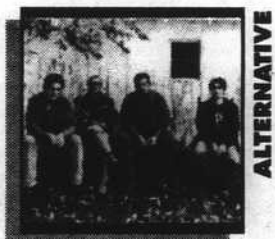
ASS PONYS Known Universe $11.88 CD

The three members of Lustre met in Charlotte, NC and after forming the band in October 1993 they made their first demo tape just two months later. Each member of Lustre comes from a different musical background. This combination of musical influences has given Lustre the tools to produce a collection of brilliant, melodic songs capable of being played on multiple radio formats.