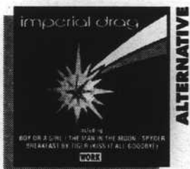
IMPERIAL DRAG Imperial Drag $11.88 CD

Since forming the quintet five years ago, The Badlees have enjoyed critical acclaim and substantial radio support from their first two releases on the band's own "Rite Off Records" label. River Songs is a collection of dulcimers, dobros, mandolins, jaw harps and harmonicas, along with guitars, keyboards, bass and drums, all of which help The Badlees create their own special brand of roots rock.