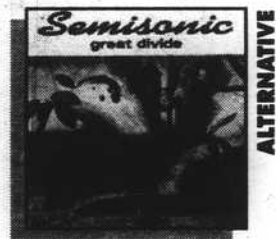
SEMISONIC Great Divide $9.88 CD

Raised on the college and club scene around Virginia's College of William & Mary and solidified in the Orlando, Florida club circuit, the rock quartet's widely praised live powers have earned them a devoted local following. With the band's track record for turning mere listeners into fans, 7 Mary 3 is poised to push their local success onto a national level.