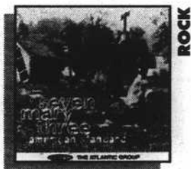
SEVEN MARY THREE American Standard $11.88 CD