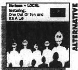
HO-HUM Local $9.88 CD

The Hunger are poised to break out of their Houston base with the release of their debut album for Universal Records, Devil Thumbs A Ride. The album clearly defines the cutting-edge sound that The Hunger has strived to create through the intense live performances they are well known for throughout Texas and Louisiana.