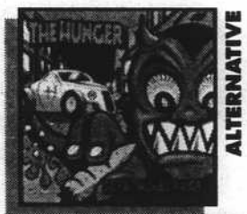
THE HUNGER Devil Thumbs A Ride $11.88 CD

As they continue to erase the fine line between right and wrong, male or female and good and evil, Marilyn Manson invites you to listen to their new EP, Smells Like Children. A concept record that is as shocking as it is educational, Smells Like Children is the perfect soundtrack to your once-silent childhood nightmares.