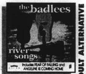
BADLEES River Songs $11.88 CD

Ass Ponys were formed in Cincinnati, Ohio in October 1989. Continuing in the Ass Ponys' tradition of brilliant story-telling, the new material indicates a significant growth in the band's songwriting and live performance, and will undoubtedly garner additional national recognition.