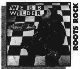
WEB WILDER Acres Of Suede $11.88 CD

Like almost everything else that this band has done in their career, the Butt Hole Surfers take on the title supergroup without any of the pretensions some other acts may carry. The Butt Hole Surfers simply are, quite definitely, a supergroup, of which few compare.