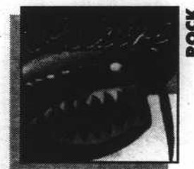
LUSTRE Lustre $11.88 CD

Babe The Blue Ox has long been regarded as one of the most unique and innovative bands on the NYC alternative scene. Their distinctive sound has been described as "a densely textured mass of careful, musical mayhem that somehow, almost magically turns into butt-shakin' jump."