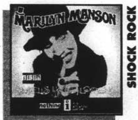
MARILYN MANSON Smells Like Children $9.88 CD