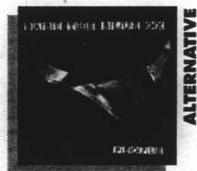
BABE THE BLUE OX People $11.88 CD

Ho-hum lives in Little Rock, Arkansas on a big continent that fits in between the Atlantic and Pacific Oceans. They have been cutting tunes in the bat cave for the past several years and play for the natives on the weekends. Local was recorded by Ho-hum in Muske Shoals, Alabama and London, England with Brit producers Clive Langer and Alan Winstanley.